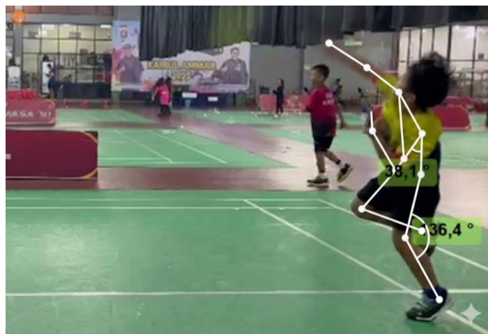
Figure 3. Landing Phase of Jump Smash Movement

The landing phase is the final movement phase of jump smash execution and is important for maintaining body stability and reducing injury risk after landing. During this phase, athletes must control body balance and absorb impact force properly to return quickly to the ready position. Figure 3 illustrates athletes' body positions during the landing phase.